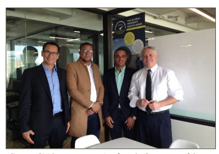
Figure 5: GLA hosts representatives from the Government of the Dominican Republic's Titling Agency in March 2019.

GLA, working with study partner INSUCO finalized a comprehensive study for the Government of Haiti's Interministerial Committee for Land Management (CIAT), funded by the Inter-American Development Bank on the linkage between land tenure and