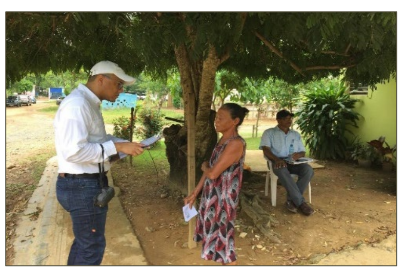
Figure 6: Compilation of documents in the field, during the Social Work campaign in El Dean, Municipality of Monte Plata

rural land use in two communes of Haiti, Camp Perrin and Saint Suzanne. The study sought to understand how recent land tenure formalization campaigns influenced land use decisions of farmers. The study used extensive parcel-level land tenure data collected during the implementation of CIAT's Rural Land Tenure Security Project and combined with land use data interpreted from high