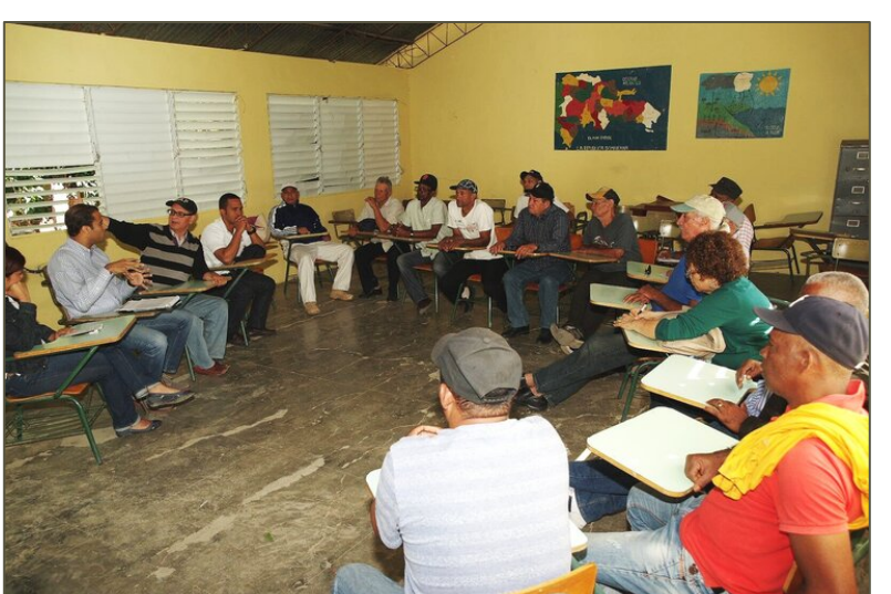
Figure 8: Focus group in El Dean, Dominican Republic where community identified potential social risks posed by systematic formalization

Multipurpose Cadaster: under the coordination of the Treasury Ministry, and working with multiple Dominican government land agencies, GLA and REDDOM completed a rapid institutional, technical,