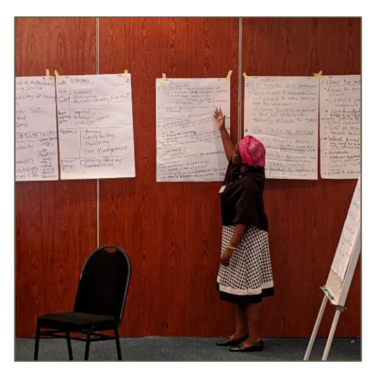
Figure 10: HRH [Her Royal Highness] Chieftainess Msoro, Kunda Chiefdom, scoring FTAT indicators at the Securing Forest Tenure FTAT Workshop in Lusaka, Zambia. Dec 2019

During the 2019 World Bank Conference for Land and Poverty, the GLA-developed Analytical Framework for the Securing Forest Tenure Rights for Rural Development initiative was launched. The Analytical framework is a first product of a longer partnership between World Bank and GLA, funded by the World Bank's Program on Forests (PROFOR). The Analytical Framework seeks to enhance the World Bank's capacity and effectiveness to strengthen forest tenure security in forest landscapes as a foundation for rural development.