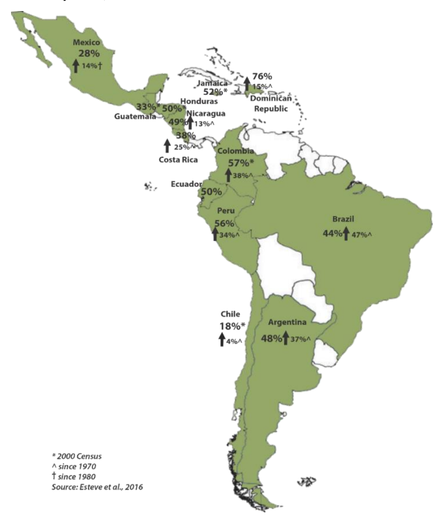
Diagram 1: Percentage cohabitants among women aged 30-34 who are in unions/marriages with men (Esteve et al., 2016)

According to the most recent data (in most cases, the 2010 censuses), the following percentages of 30-34-year-old women in unions with men (marriage and cohabitation) were cohabitating: